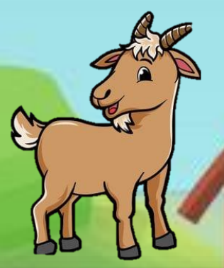
"Oh no," said the second billy goat Gruff. "Don't eat me. Eat the third billy goat Gruff. He's big and fat."